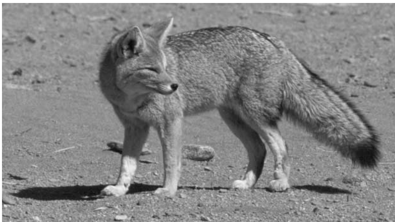
Figure 15.2 Pseudalopex griseus (Chilla).

In Neuquén, both culpeos and chillas were selective in their food habits, but selectivity for certain prey differed according to whether biomass or densities of prey were considered. Prey selection by culpeos changed between areas of allopatry and sympatry with chillas (Tables 15.3 and 15.4). In spite of the lower hare density in the area of sympatry, in both areas culpeos consumed hares more than expected according to their biomass available, carrion less than expected, and cricetines in similar proportion